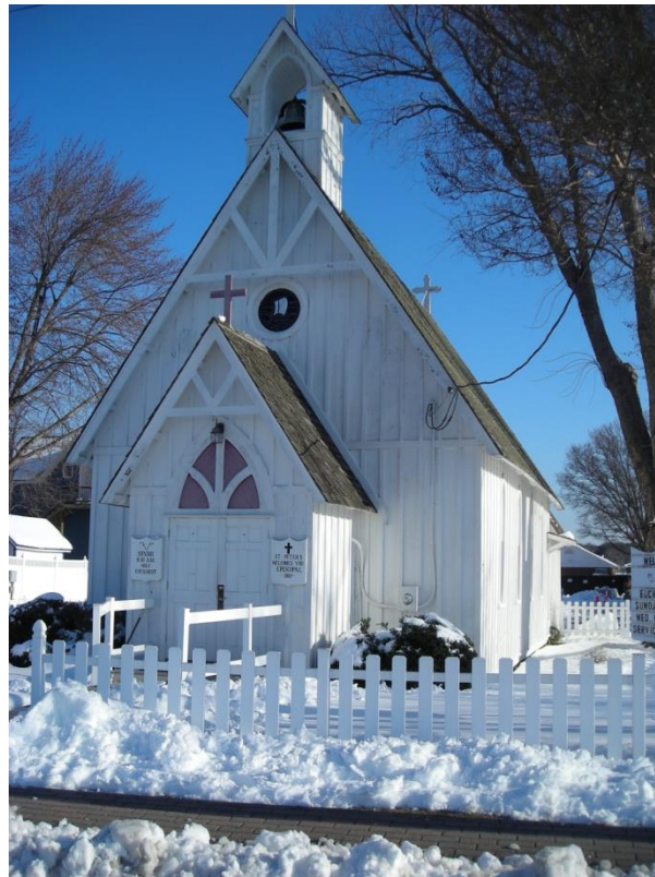
ST. PETER'S CHAPEL