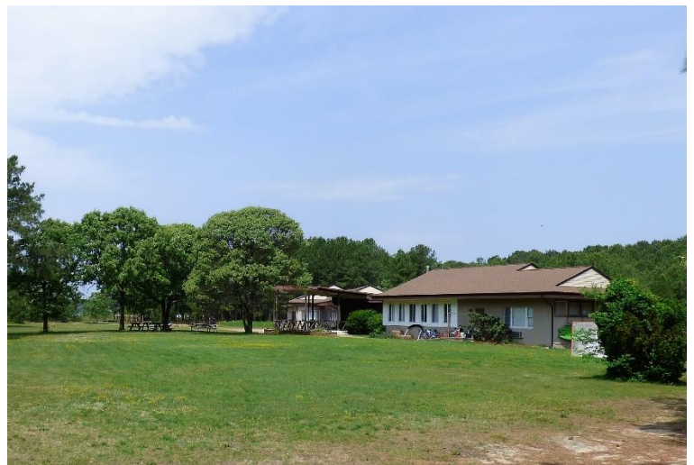
lawn area and club house