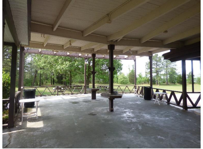
Covered deck at club house