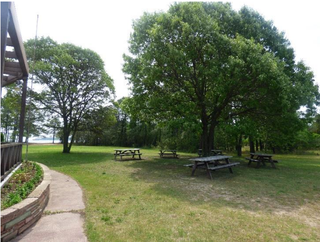
Picnic tables under trees