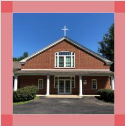
MIDDLEHAM CAMPUS @ SMITH HALL

ALL SAINTS' CELEBRATION JOINT SERVICE SUNDAY NOVEMBER 4 TH @ 9:30 IN SMITH HALL