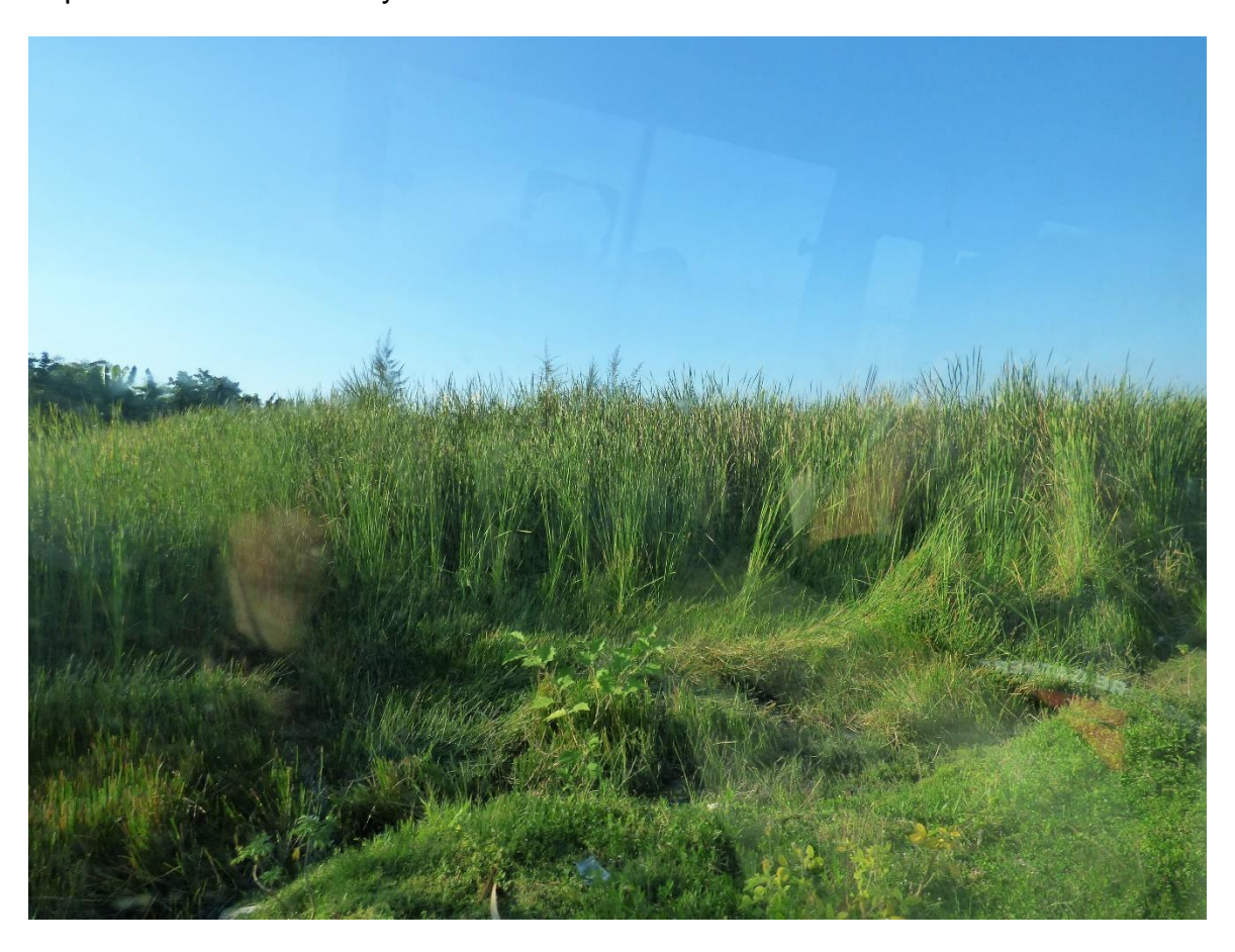
In spite of the desperate poverty, the people of Haiti are resilient, and the country has beautiful mountains and the Caribbean Sea.

Growing and harvesting sugar cane is the principal crop and industry in the area. This has been the principal crop in Haiti for over 400 years.