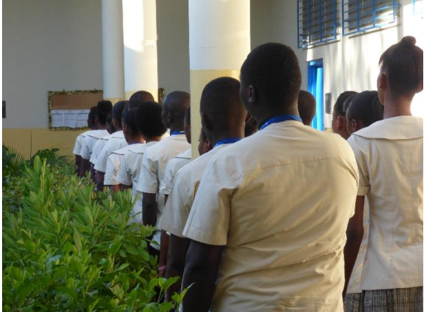
And after school students have sports