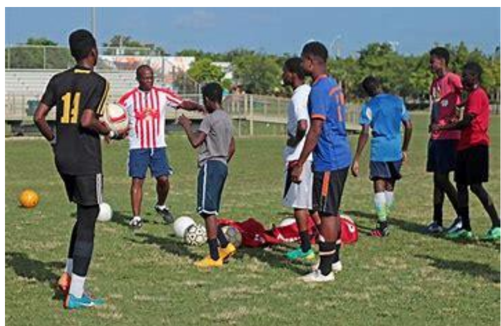
Soccer is the most popular sport.